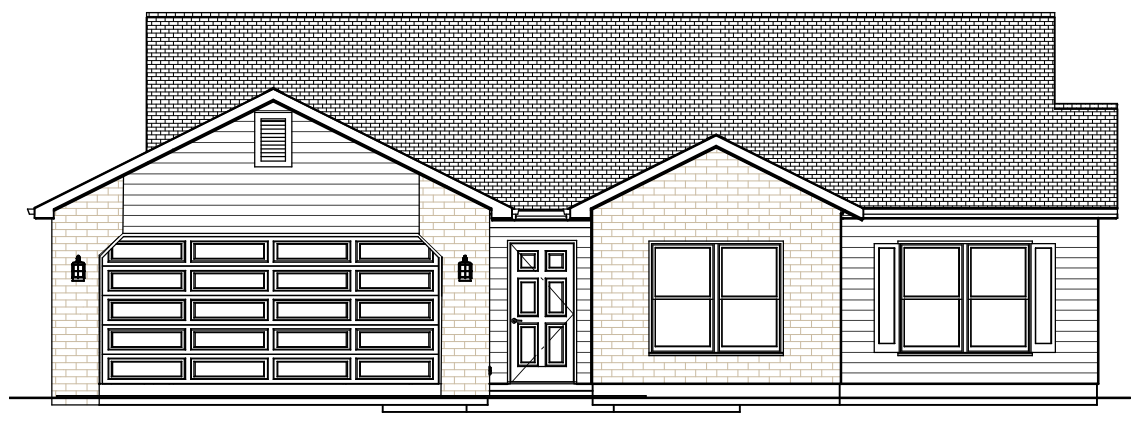
ELEVATION A WITH PARTIAL BRICK