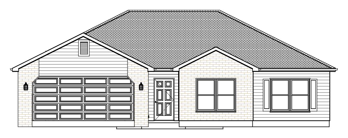
ELEVATION C WITH PARTIAL BRICK